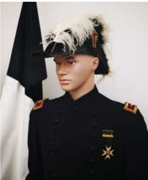
Fig. 3. Uniform's coat and hat

C. Ruedy's personal effects which are in the museum's collection include his regulation trousers, coat, hat (Figure 3), commandery badge (Figure 4), belt, and sword.