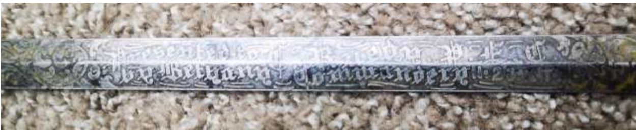
Fig. 6. Inscription on the blade of C. Ruedy’s sword

The inscription on the sword’s blade reads ‘Presented to C. Ruedy, P.E.C., by Bethany Commandery No, 28, K.T.’ (Figure 6).