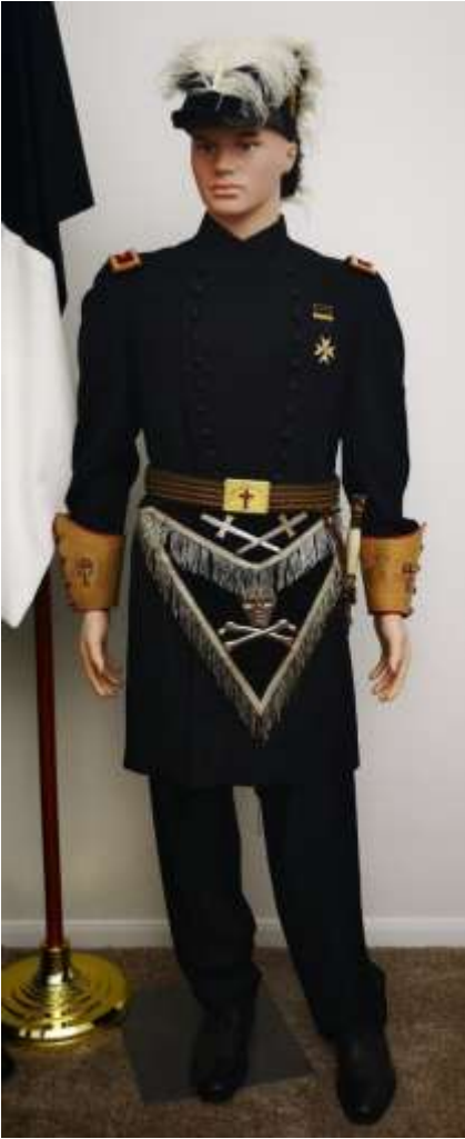
Fig. 2. Uniform of Past Eminent Commander Casper Ruedy

C. Ruedy's personal effects which are in the museum's collection include his regulation trousers, coat, hat (Figure 3), commandery badge (Figure 4), belt, and sword.