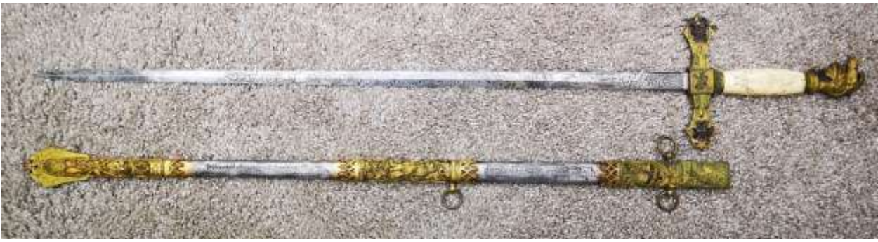
Fig. 5. C. Ruedy’s gold sword

The inscription on the sword’s blade reads ‘Presented to C. Ruedy, P.E.C., by Bethany Commandery No, 28, K.T.’ (Figure 6).