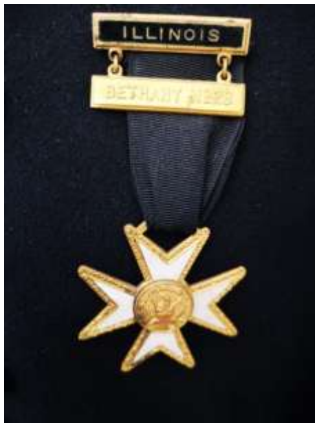
Fig. 4. Commandery badge